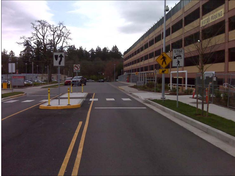
Capitol Street SE crosswalk facing south toward Mission Street SE.