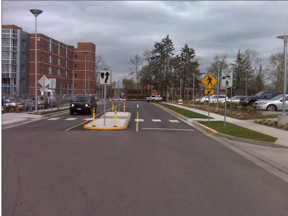
Capitol Street SE crosswalk facing north toward Oak Street SE.